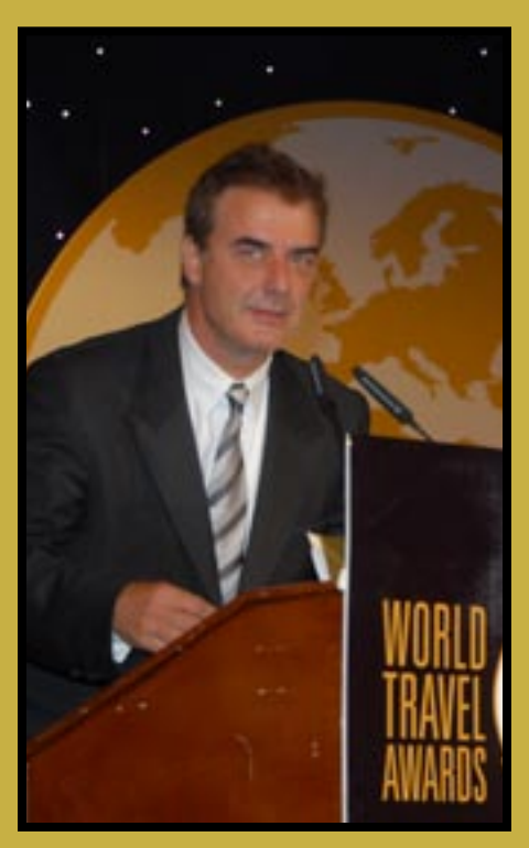
CHRIS NOTH FROM LAW& ORDER AND SEX IN THE CITY