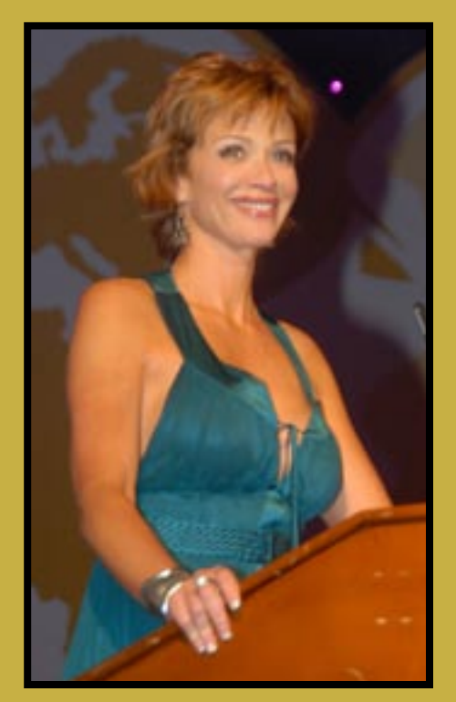
ACTRESS LAUREN HOLLY